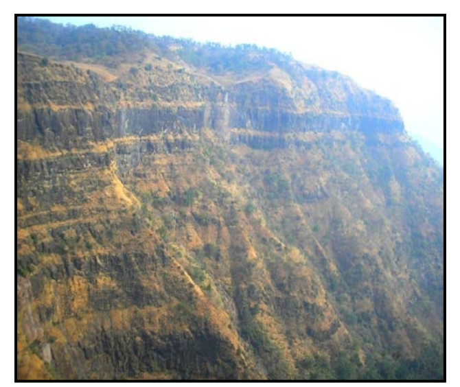
Fig.1 Thick horizontal flows of Basalt

Kulkarni P.S. (1985) demarcated various flows in different ghat sections of NE and central part of Maharashtra[2].